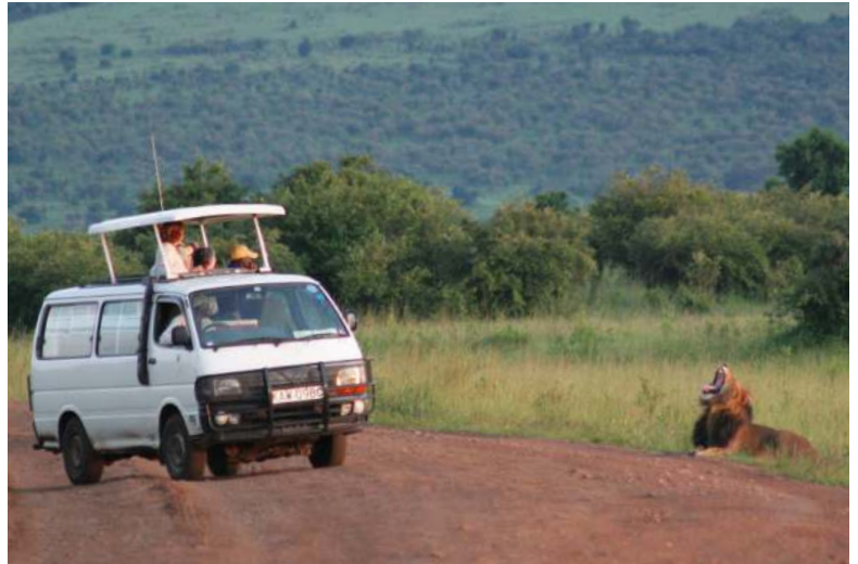
Get close to the "Big Five" animals on safari