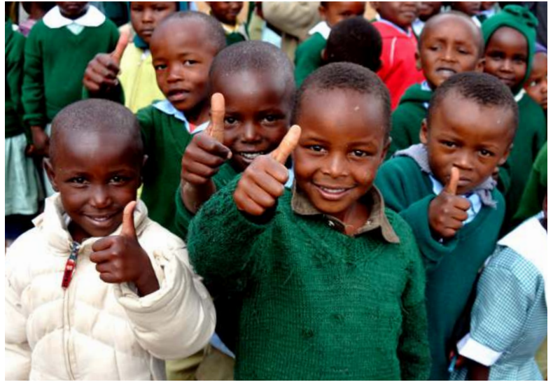
Visit students supported by the Ngong Road Children Association

Register at wildernessinquiry.org/NgongRoad