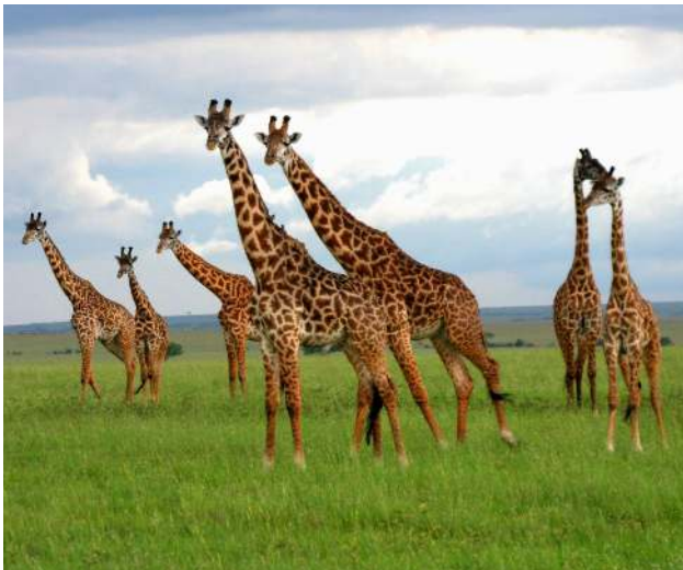
Giraffes are everywhere